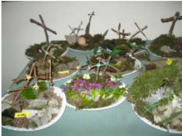
Our Easter gardens