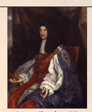
King Charles II King Charles II was the King of England in 1666.