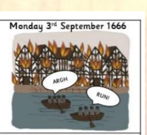
The people of London started to run away from the city. They escaped on boats across the Rive Thames.