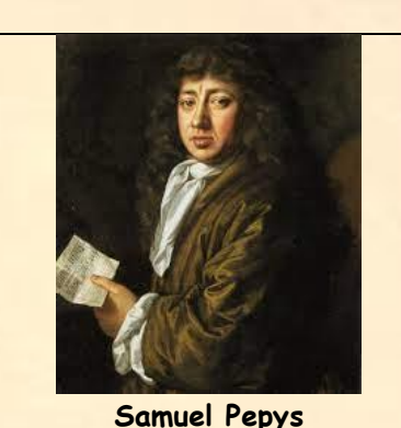
Samuel Pepys lived in London during the Great Fire of London and wrote about it in his diary.