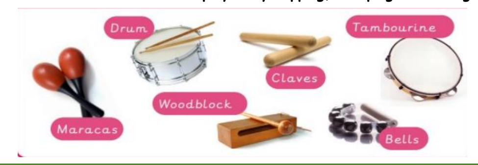
Percussion instruments are played by tapping, scraping or shaking

The beat usually stays the same all through the music.